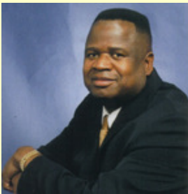
Munyonzwe Hamalengwa African Renaissance Award

International Centre [ Brand New Ballroom ] Toronto, Ontario Canada