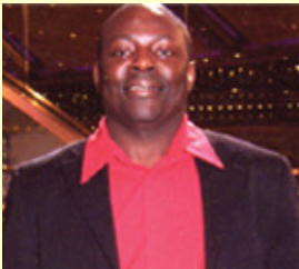
Agostinho Neto Determined Achiever Academic Award